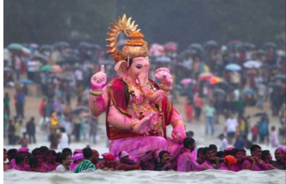
Photo Courtesy: 1. By Srivatsan (Own work) [CC BY-SA 3.0 ( http://creativecommons.org/licenses/by-sa/3.0/ )], 2. Wikimedia Commons by Suriyan Sai Pattinapakkam, Ganesha is been thrown into sea on Ganesh Chaturthi.