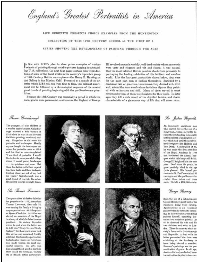
Figure 3: "England's Greatest Portraitists in America," Life , January 24, 1938, p. 28.

throughout the magazine, Life added an element of formality to these art stories by giving their headlines and subtitles an ornate italic flourish and using formal language to describe its lofty offering. In introducing the story, for example, the magazine wrote, " Life herewith presents choice examples from the Huntington Collection." 6 Introductory text gave readers a schema from which to understand the reproductions that followed. Emphasizing the period's "taste and elegance and wit and charm," Life's interpretation of eighteenth-century British portraiture gave readers an easily digestible overview of the period peppered with gossipy personal tidbits about the artists, Thomas Gainsborough, Sir Joshua Reynolds, Sir Thomas Lawrence, and George Romney,