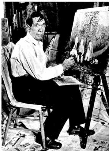
On rainy days, John Kane painted on canvases because bad weather kept him from plying his trade as house painter. Sundays and holidays he would go into the country around Pittsburgh, make sketches, bring them home to be worked over in paint. He would return to the scene of his painting again and again to make sure that his rendering was accurate.

By the time Kane became a serious and frequent painter, his hand had grown too stiff to permit him to draw easily. His honest, literal work suggests that of a child artist but it is not childish. Kane's talent carried him over the all-important gap that separates the childish from the childlike. It is the open-eyed, childlike quality that gives Kane's work much of its charm. Though his perspective often went awry, Kane's instinctive feeling for composition brought unity and a grace of decoration into his painting. His deep religious feeling is the base of the literalness in his work. He said he wanted to paint things just as God made them.