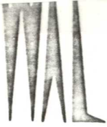
Figure 2. Assay reports on Caribou Mine samples