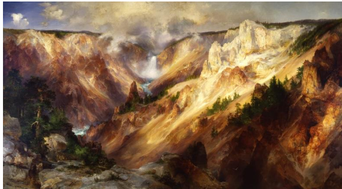
“The Grand Canyon of the Yellowstone”, Thomas Moran, 1872.

Painters Thomas Cole, Thomas Moran, Albert Bierstadt and philosopher and writer Henry David Thoreau presented wilderness in grandiose, naturalistic rhetoric. George Catlin employed comparisons to Eden when visiting Yellowstone—a space conceived as spiritual and political refuge.