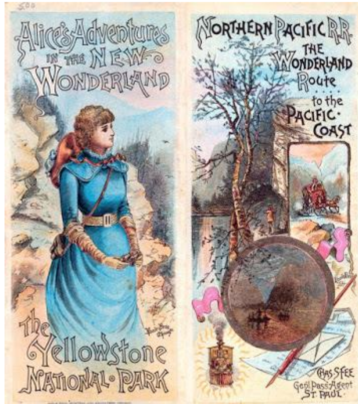
Figure 2. "The Wonderland Route to the Pacific Coast." 1885

Initial advertisements framed Yellowstone as a wonderland in accordance with its sublime descriptions. Marketing techniques made exploration activities fashionable for young white women, as seen in the advertisement above. Advertisements emphasized individuality, an emotional experience of being alone in nature while also being elegantly clothed and accommodated comfortably. This experience, administered by the state, promoted reflective and adventurous private experiences. These qualities affirmed the nationalized cultural landscape.