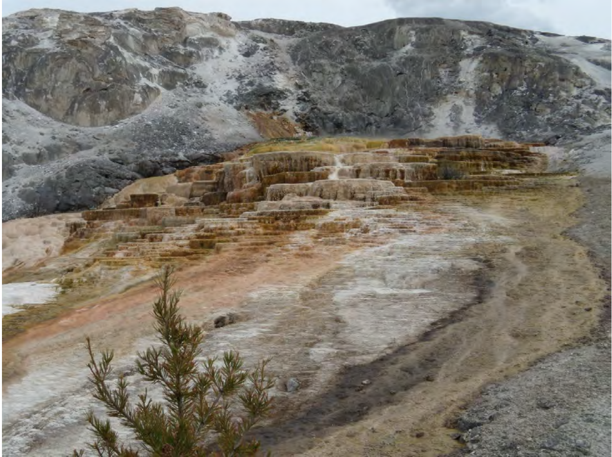
Figure 4. PhotoPoint “Fudge” at Week 3