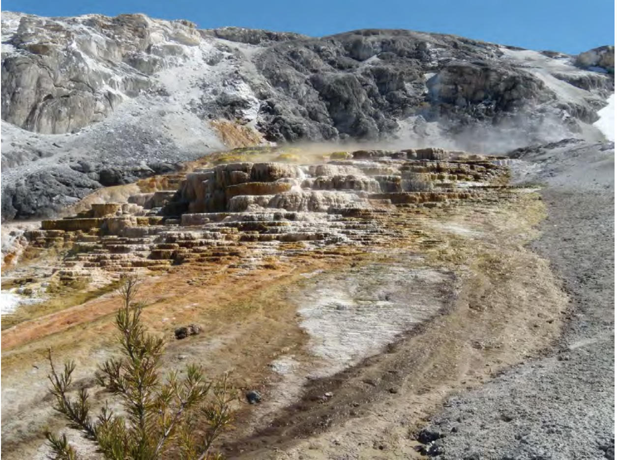
Figure 2. PhotoPoint “Fudge” at Week 1