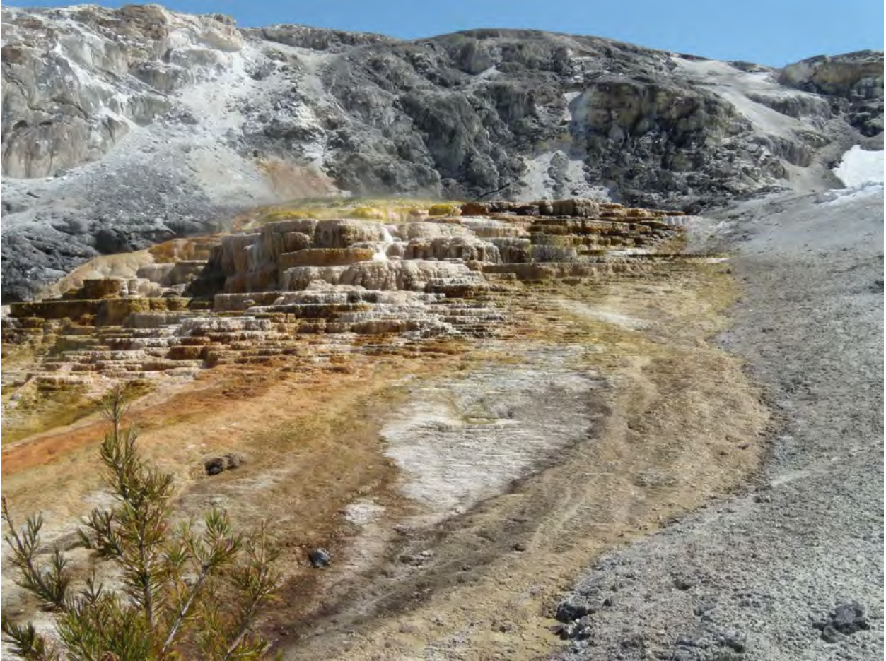
Figure 3. PhotoPoint "Fudge" at Week 2