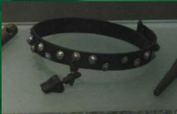
Dog collar from Viking grave site, Oslo Ship Museum