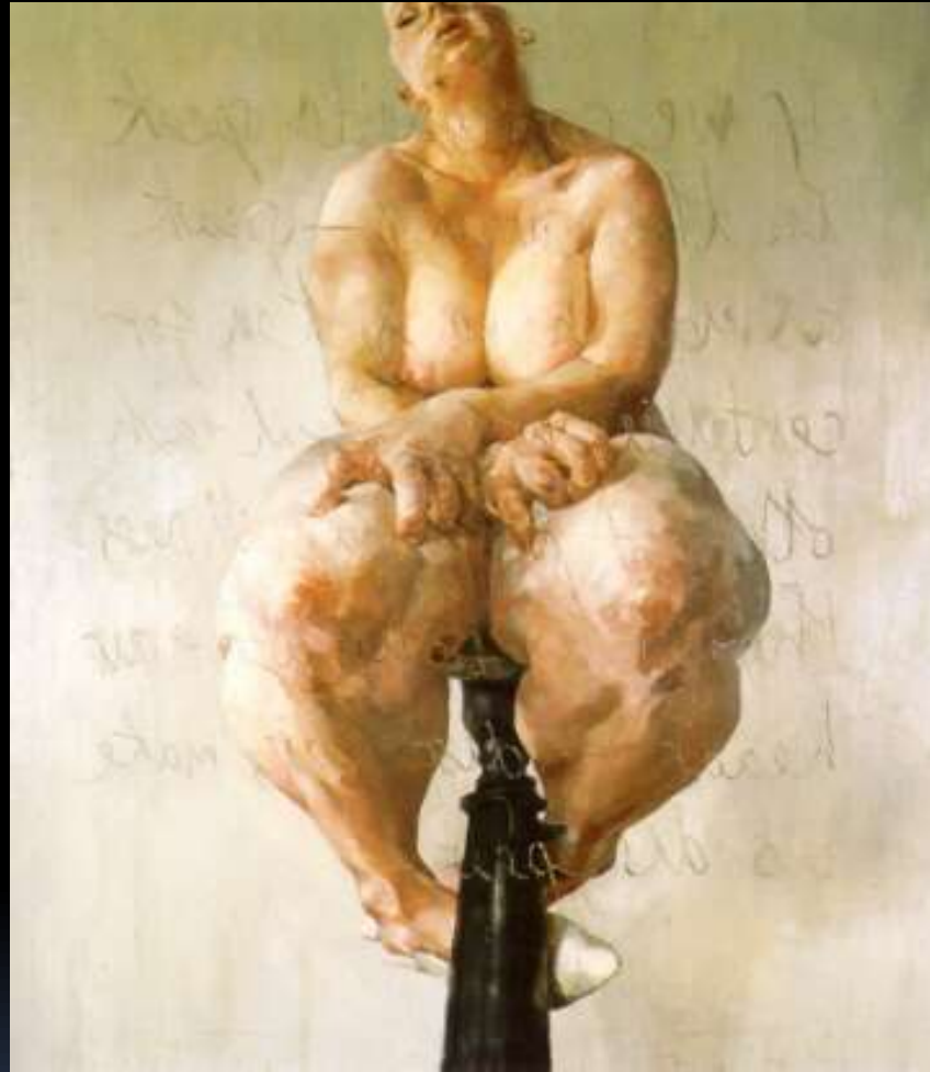
Jenny Saville, Propped , 1992. Oil on canvas.