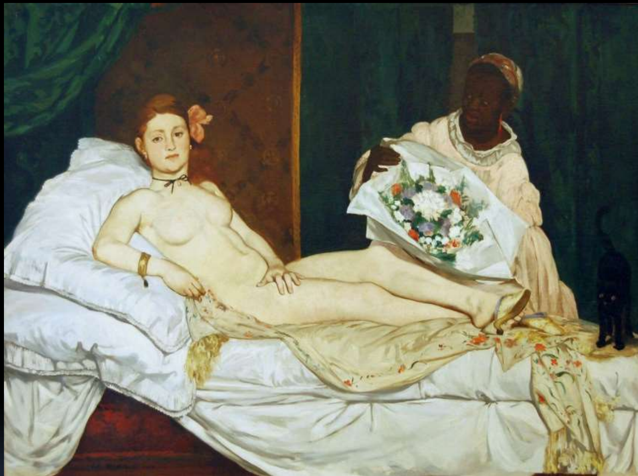
Édouard Manet, Olympia , 1863. Oil on canvas.(Musée d'Orsay, Paris).