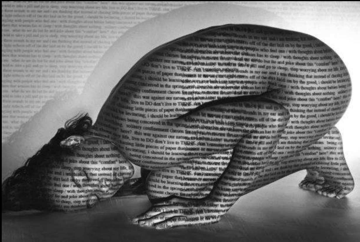
Darren Saravis, Tamara , 2007. Photography.