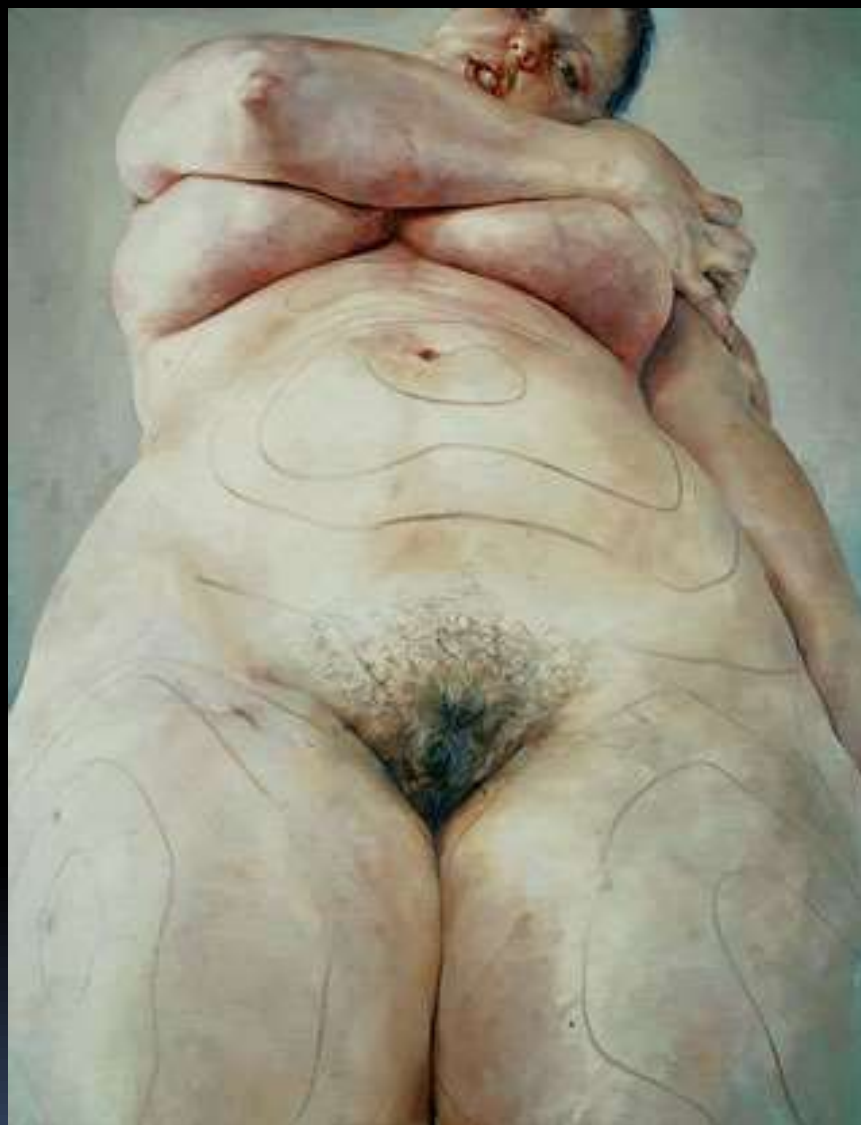
Jenny Saville, Plan , 1993. Oil on canvas.