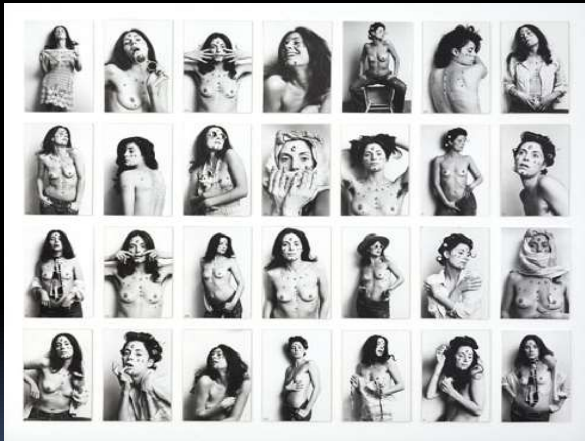
Hannah Wilke, S.O.S. Starification Object Series , 1982. Photography. (New York).