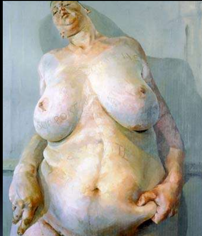
Jenny Saville, Branded , 1992. Oil on canvas.