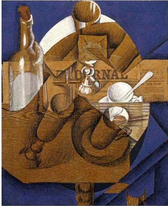
Juan Gris. Le Journal . 1914. Oil, pasted paper, and pencil on canvas. (Judith Rothschild Collection).