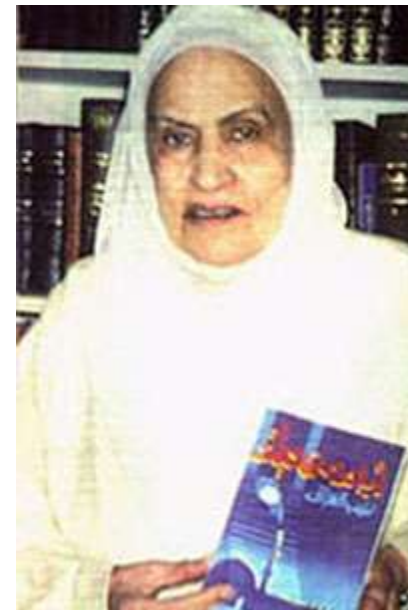
Zainab Al-Ghazali (1917-2005)

http://siswihaluan.blogspot.com/2009/12/who-is-zainab-al-ghazali.html