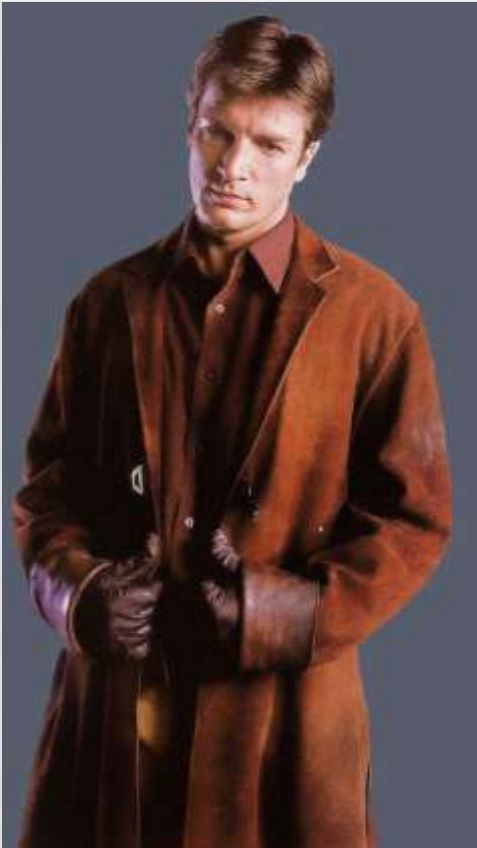
Captain Malcolm “Mal” Reynolds