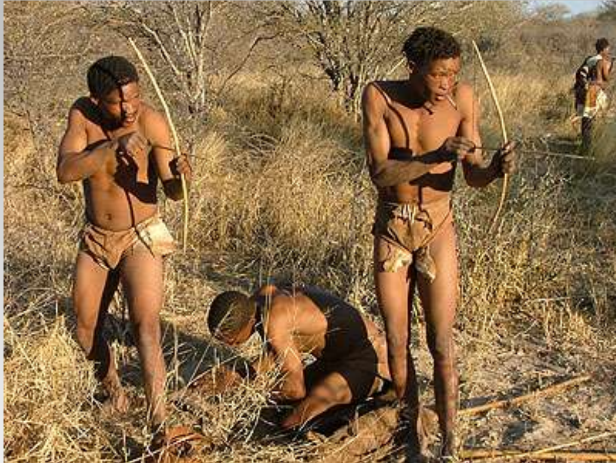
The !Kung Bushmen- The classic anthropological study