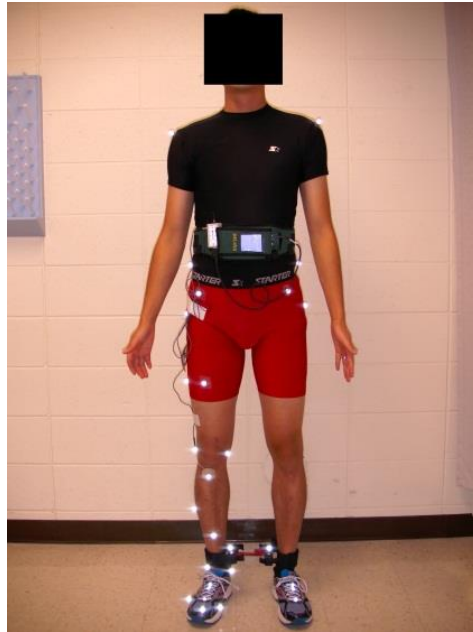
Figure 1: Marker Placement

lateral femoral condyles, superior and inferior tibia, lateral tibia, medial and lateral malleolus, toes, heel, and first and fifth metatarsal head of the dominant side (Figure 1). The three-dimensional location of the markers were tracked using 8 cameras positioned around the testing facility.