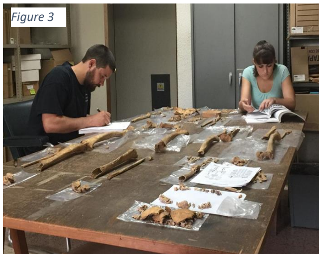
Figure 3 Fellow student and myself analyzing burials from Angamuco at the Centro de Estudios Mexicanos y Centroamericanos (CEMCA) in Mexico City.

During the Purépecha Biohistory Project, one of the sets of remains I analyzed was that of a well preserved young adult female from Angamuco. The bones of this individual displayed