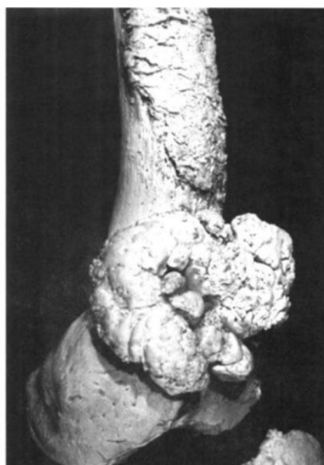
Example of bone involvement in a case of melorheostosis.

distribution of bony lesions, melorheostosis' involvement of the skeleton is unilateral, segmental and will mostly affect the bones of a single limb (Wadhwa 2014). Furthermore, it is most commonly observed on the lower limbs, and in rare occasions exhibits lesions on the vertebra and the crania.