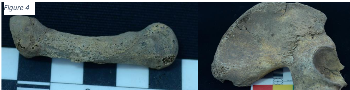
Burial 14.2 Examples of PNBF: Top Left: Lateral right 5th metacarpal demonstrating layered periostitis. Top Right: Lateral view of right innominate with PNBF along gluteal line. Bottom: Diaphysis of right femur showing layered and “peeling” of periostitis. Note unaffected cortical bone below the pealed portion of the periosteal reaction.

radiographic evidence for this individual, it is difficult to determine disruptions in the osteoblastic and osteoclastic activity ratios. However, in areas where the periosteal sheathing has been broken away, macroscopic analysis did not reveal a great deal of change to the underlying cortical bone. For examples, see figure 4.