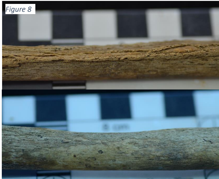
Top Photo: Individual 14.2 left ulna displaying “dense and lumpy” periosteal reaction. Bottom Photo: Individual 14.2 right radius displaying multi-layered and laminated periosteal reaction.